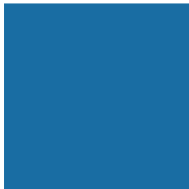
Regal Blue (70)