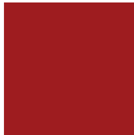
Rotunda Red (65)